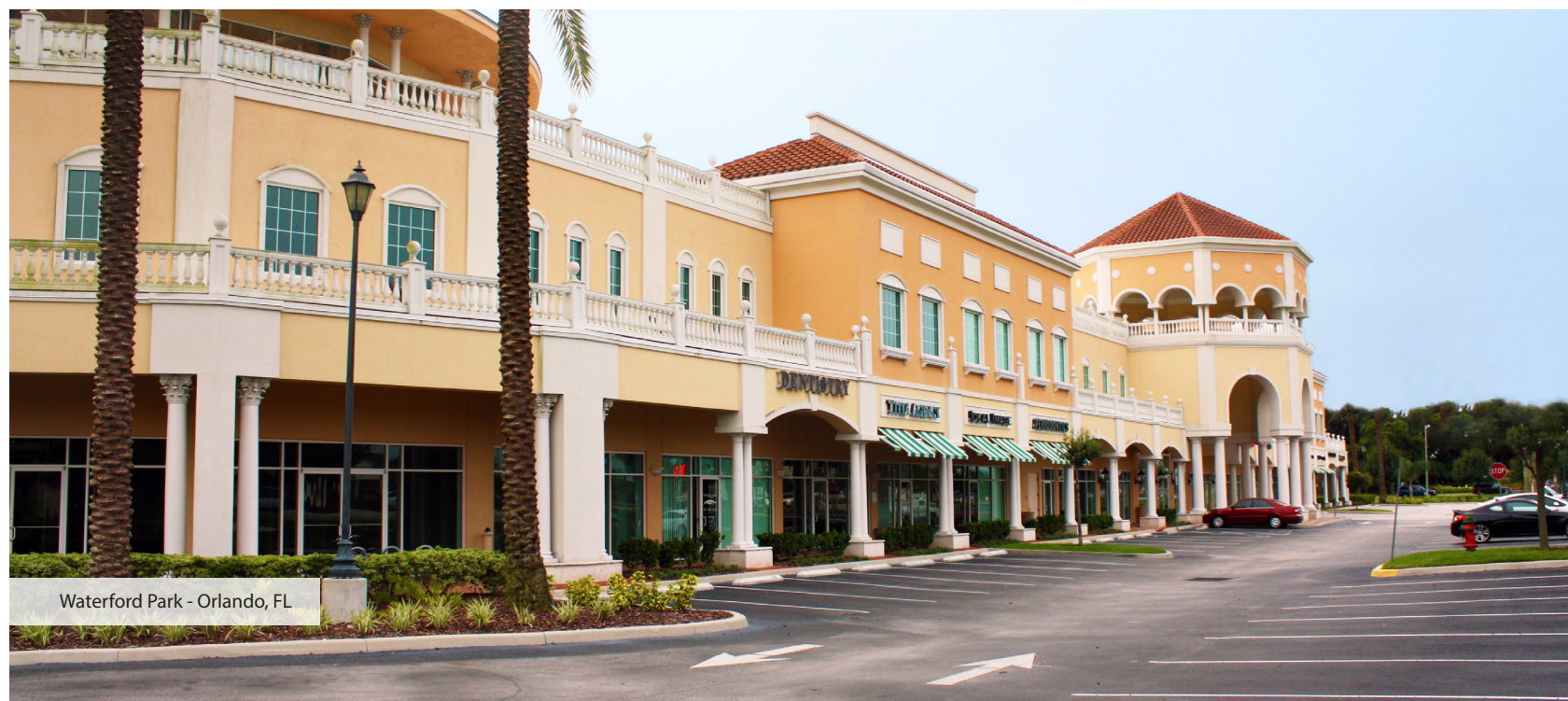
Waterford Park - Orlando, FL

Hold Thyssen provides comprehensive property management services that go beyond the traditional model by focusing its people, systems and technology to meet the specific needs and objectives of each individual property. Although strategies differ with