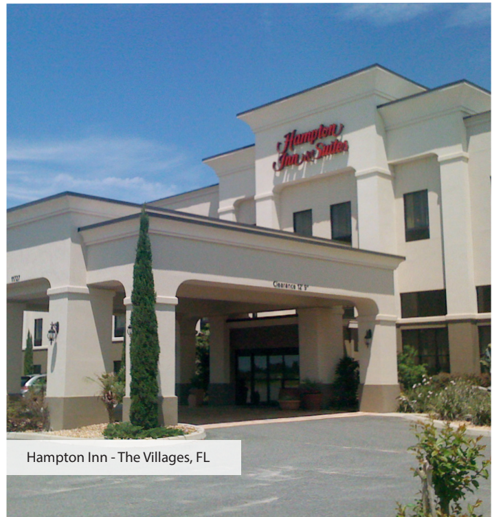
Hampton Inn - The Villages, FL

opening, interim and closing reports for each Receivership property on schedule. Each report is tailored specifically to the needs of the court and served to all appropriate parties.