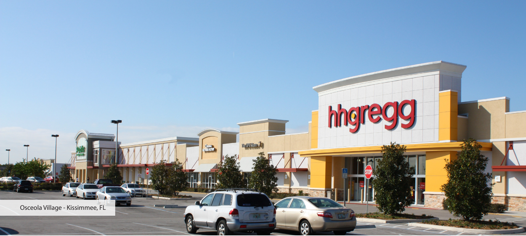
Osceola Village - Kissimmee, FL