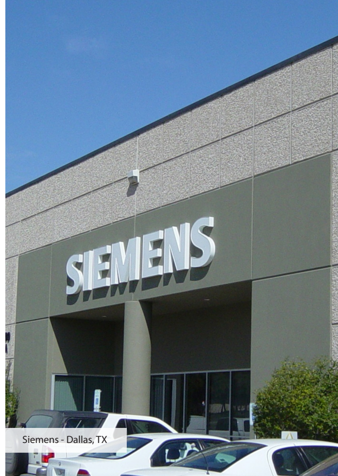
Siemens - Dallas, TX

each property based on the objectives of the investor and the economy, our goal is always the same – To maximize the return on investment and create value for our clients.