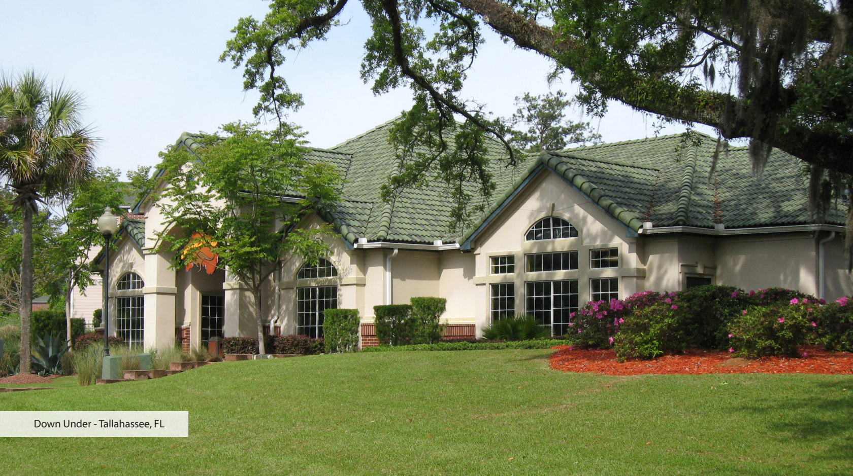
Down Under - Tallahassee, FL