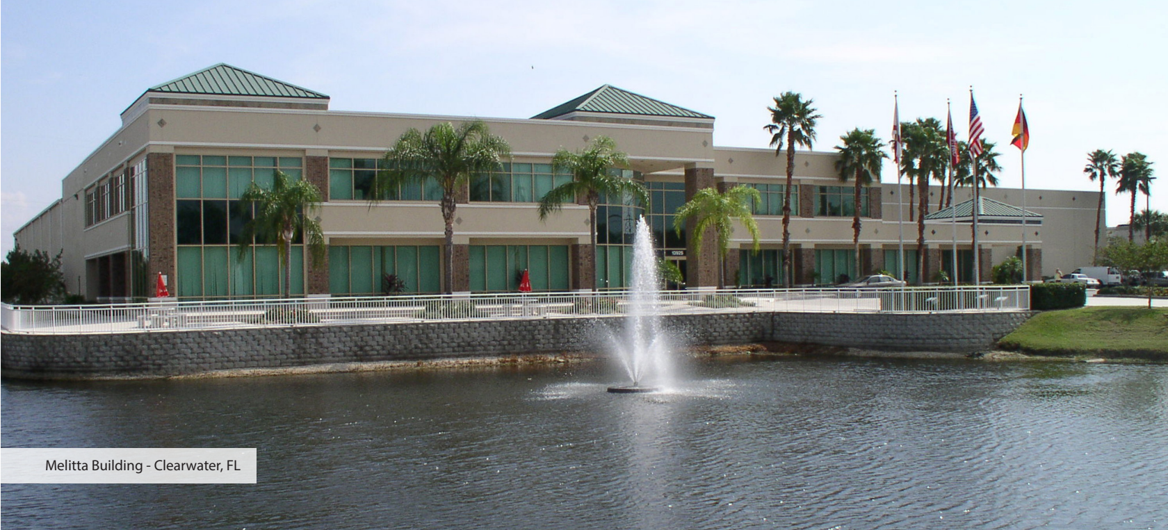
Melitta Building - Clearwater, FL