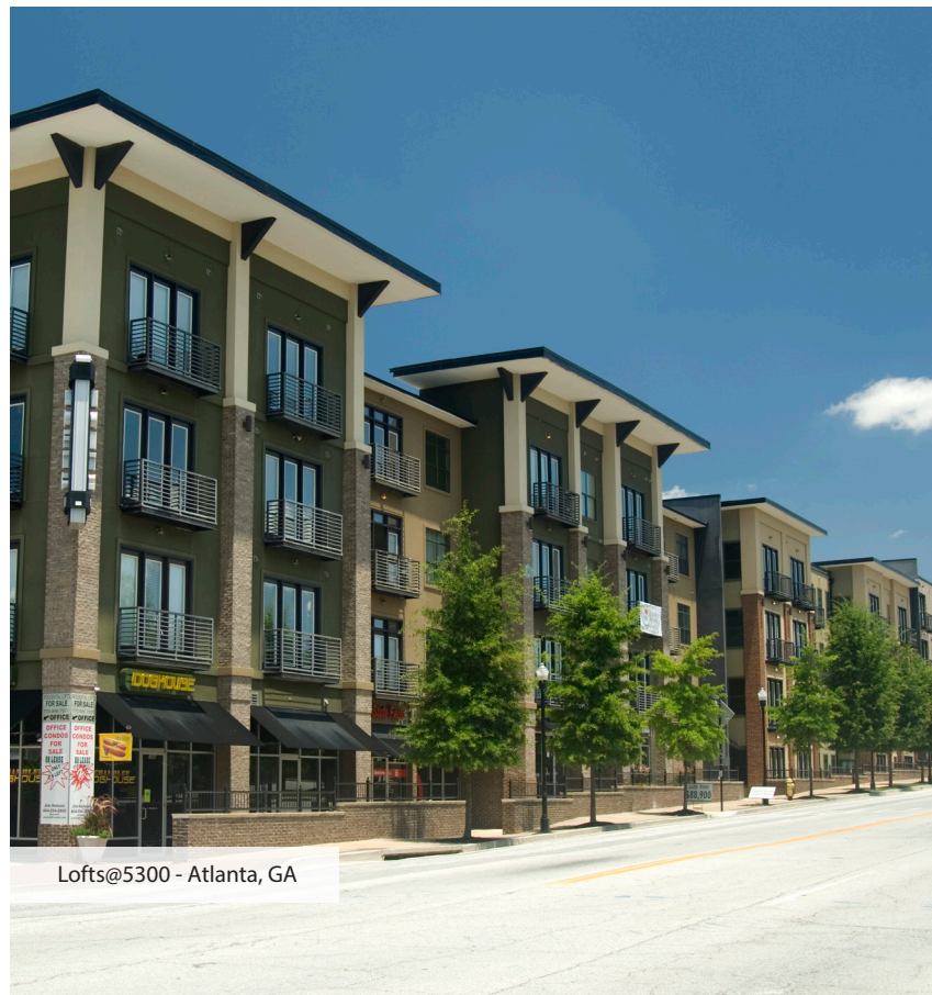
Lofts@5300 - Atlanta, GA