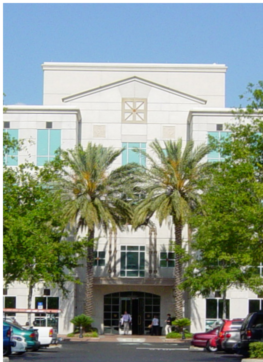
Lucien Pointe - Maitland, FL