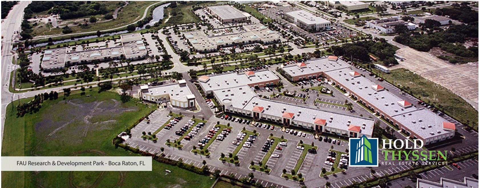
FAU Research & Development Park - Boca Raton, FL

in superior market knowledge as well as the ability to identify opportunities and structure transactions that are both highly creative and completely realistic.