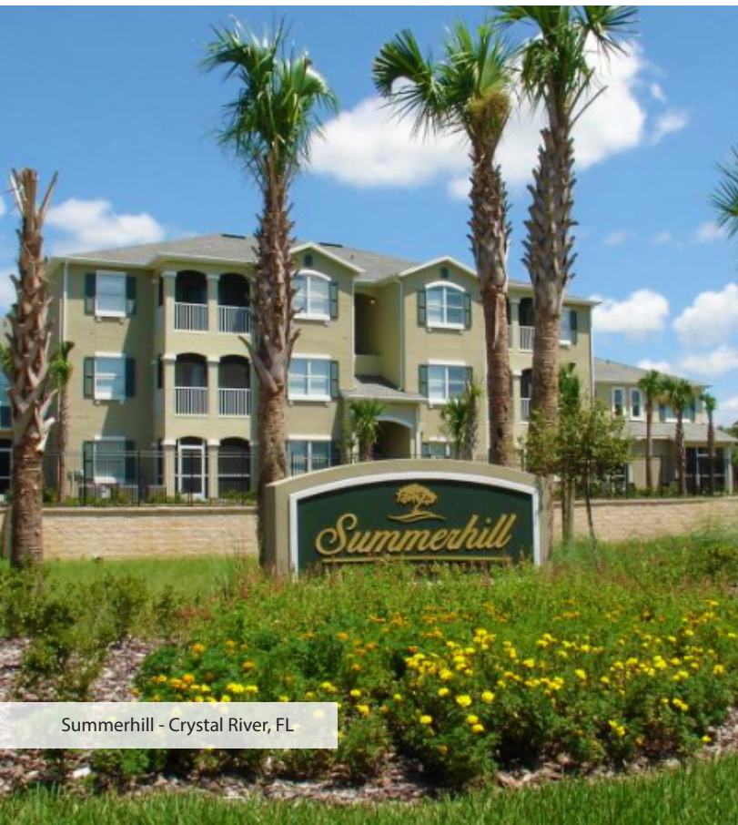
Summerhill - Crystal River, FL

With market knowledge and expertise, Hold Thyssen will implement a mixture of innovative marketing strategies to maximize income through occupancy.