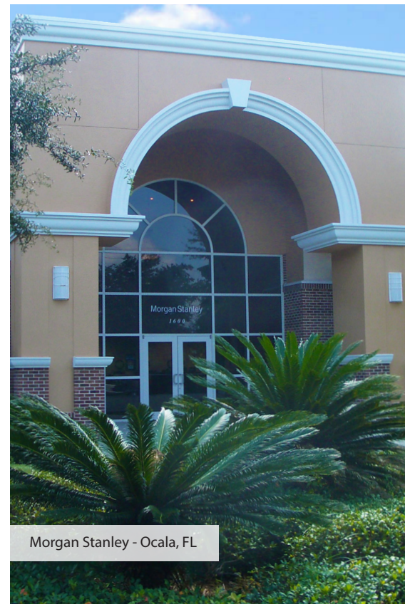
Morgan Stanley - Ocala, FL