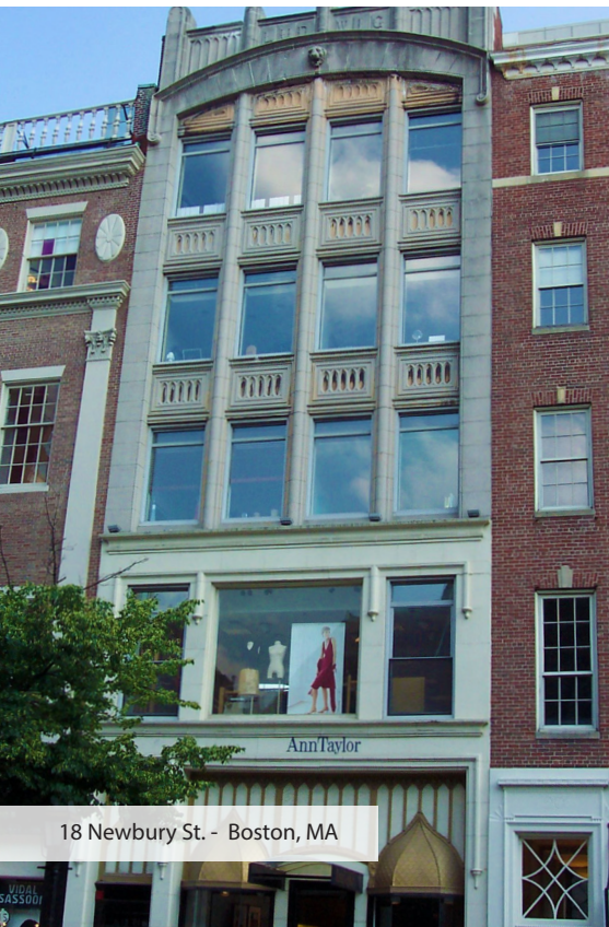
18 Newbury St. - Boston, MA