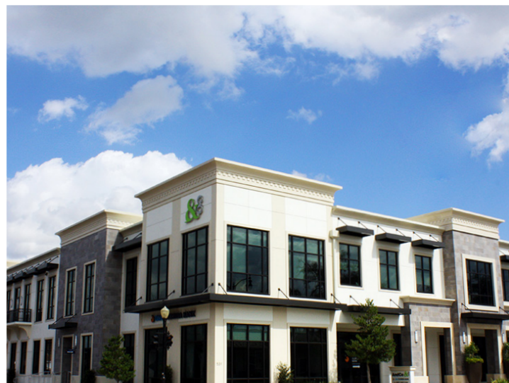
Andco Building - Winter Park, FL