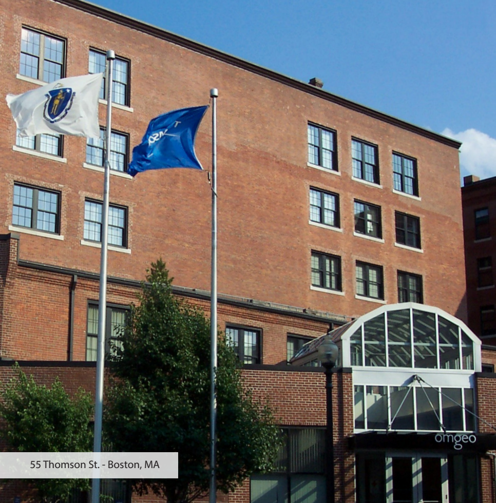
55 Thomson St. - Boston, MA